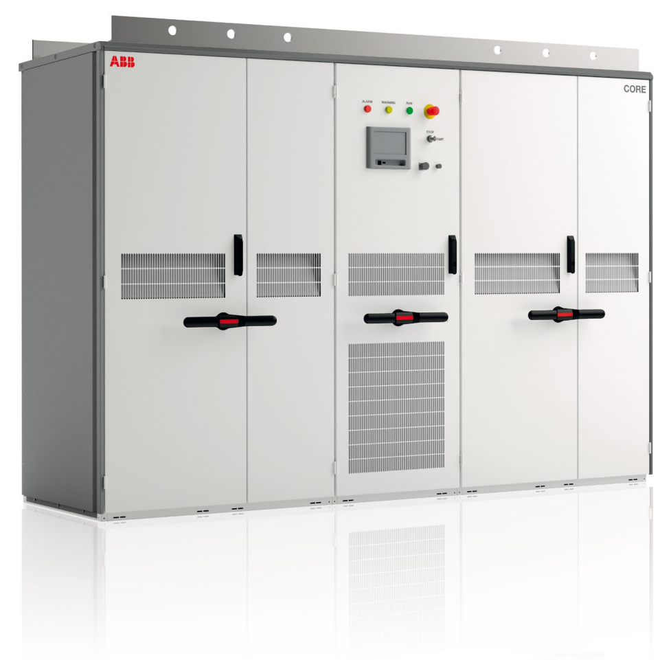
ABB central inverters CORE-500.0/1000.0-TL 500 to 1000 kW

Specifically tailored for the fast growing Chinese market, the CORE-500.0 and 1000.0 incorporate a number of key features including a maximum input voltage of up to 1000 Vdc, enabling high design flexibility and reduced DC distribution losses for large-scale PV applications.