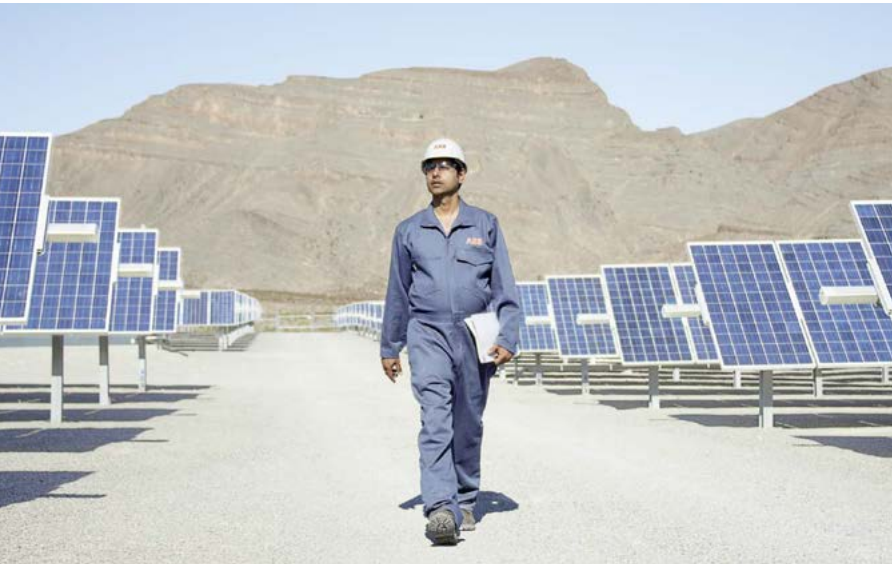
ABB On-site Repair service provides you with the latest solar inverter expertise at the location you need. Your service request is quickly attended to and carried out by ABB certified service engineers. With Onsite Repair service, you can safely minimize the downtime of your solar plant.