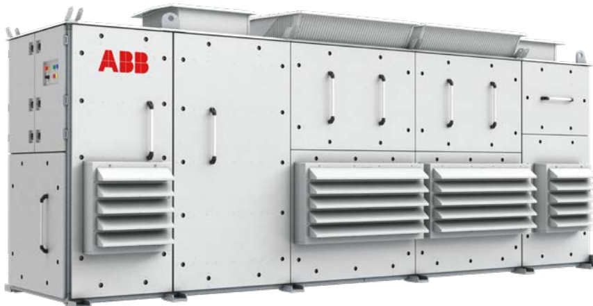
ABB central inverters PVS980-58 – 4348 to 5000 kVA